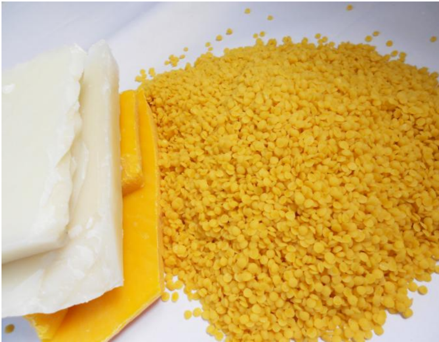
2. Food and Drug Level , can be used to make drug, capsule, cosmetic so on