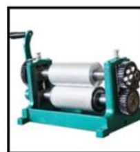
Beeswax sheet machine