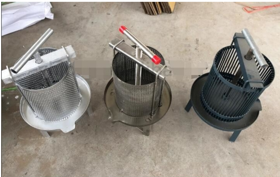
Photos of 46th Apimondia 2019, Canada